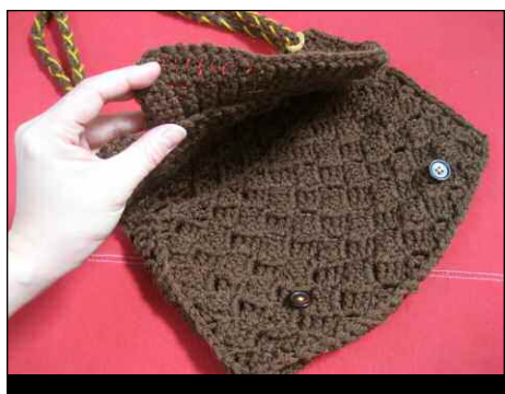
STEP 1: THE BODY